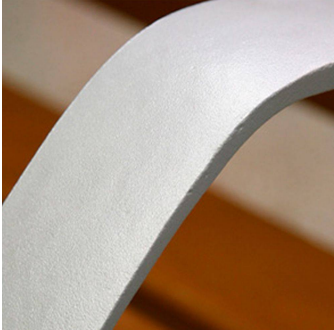
With cast aluminium feet.