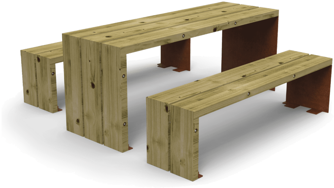
Table made of pine wood treated in vacuum pressure autoclave Class IV against woodworm, termites and insects. Stainless steel screws. 8mm Corten sheet steel legs.

Recommended anchoring: by means of M10 expansion bolts depending on the surface and the project.