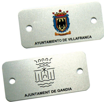
Aluminium plate 74 x 35 mm.