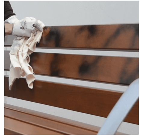
Protector for materials from paints, graffiti