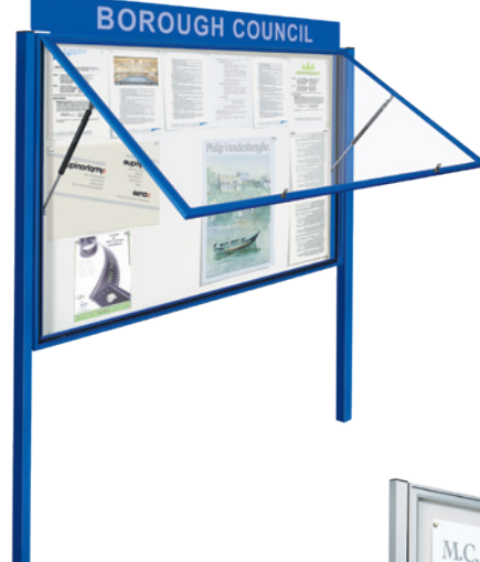
Code 406081 + 416358 + 409036*