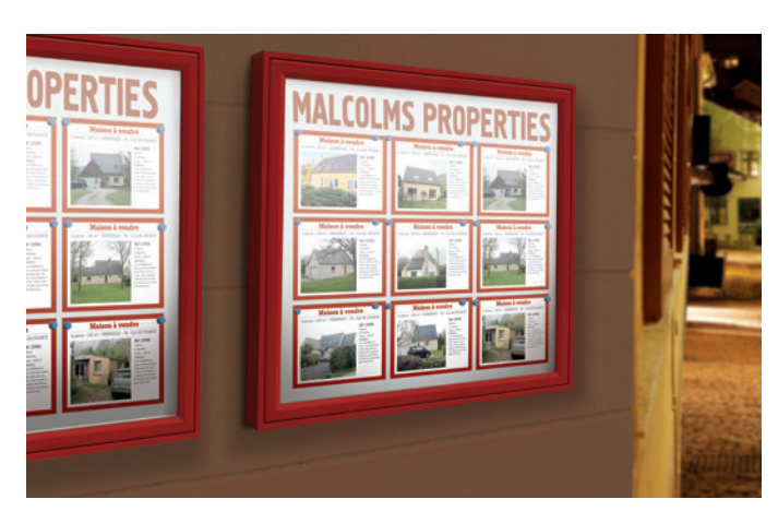
Code 406080 + 509117