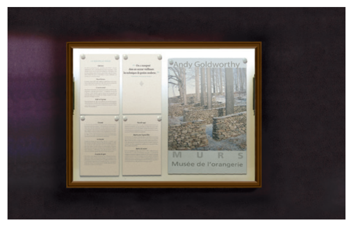
Code 407084 + 509117