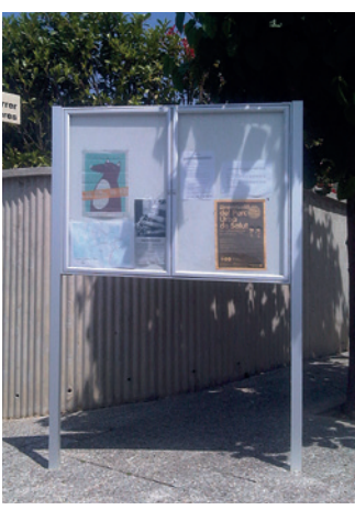
Code 505075 + 516358