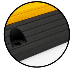
GRIPPED REAR SURFACE Provides better tyre grip on rear to prevents vehicles from becoming stranded