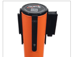
Durable stainless steel posts