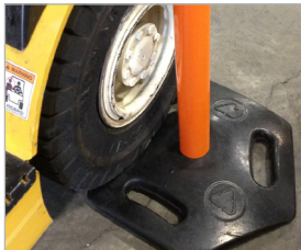
Tough recycled rubber base