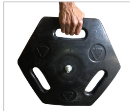
Convenient carry handles