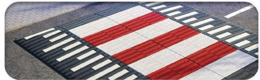
10 cm Model | Width of elements 500mm Length of elements 1000mm